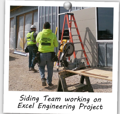
Siding Team working on Excel Engineering Project

What does that mean for you? It means you have the ability to come in here, grow, and progress in your construction career. Our Foreman, Project Managers, and Executives for the most part grew up organically in this business under Wenger and have been able to provide more for the company and their families. That is why this will be your final destination in your construction journey!