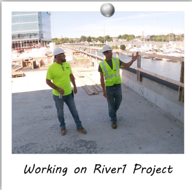
Working on River1 Project

Let me shoot you straight. Construction is not for the faint of heart; it requires grit, determination, discipline, and the will to persevere. If you and your employer are not on the same page it just compounds all the challenges that already exist in an already challenging industry. Not much of a marketing pitch huh?